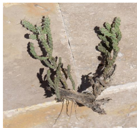
Figures 9 and 10. The herbarium sheet from Bear Creek was made from this specimen of C. whipplei .