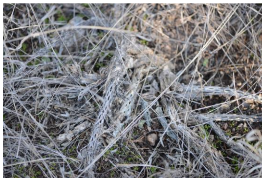
Figure 6. Skeletons of C. whipplei along Bear Creek, surrounding the main clump.