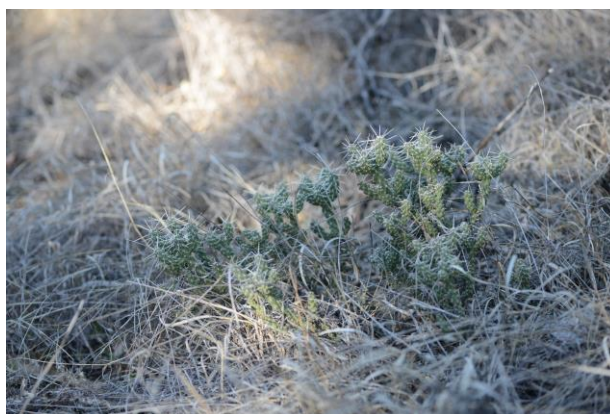
Figures 3 and 4. Clump of C. whipplei var. whipplei along Bear Creek, 8 km east of Gila, New Mex.