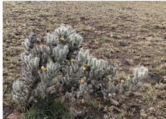
Figures 1 and 2. Ubiquitous Cylindropuntia whipplei var. whipplei along Interstate 40 in western Yavapai County, Arizona. These plants were much taller (~75 cm) and robust than the plant at Bear Creek.