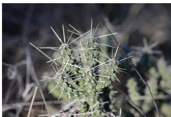
Figures 7 and 8. Close-up of terminal shoots (‘canopy’) of C. whipplei along Bear Creek.