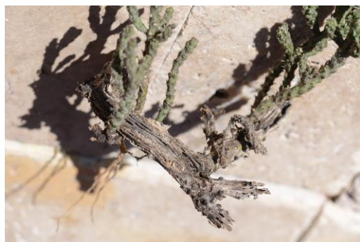
Figure 5. Underground horizontal woody shoot of C. whipplei along Bear Creek, with upright green shoots and vertical roots. The herbarium sheet was made from this specimen.